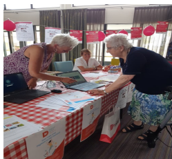
Solidarity & SWVO: Day "At home" in the village of Sint-Maartensdijk