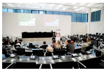
Province of Antwerp and GKC's care event with over 100 participants