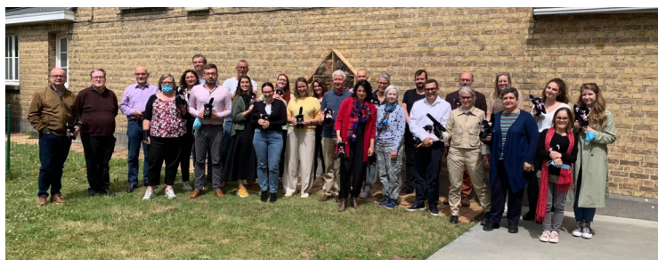
Partners meet in person for the first time since 2020 in leper.